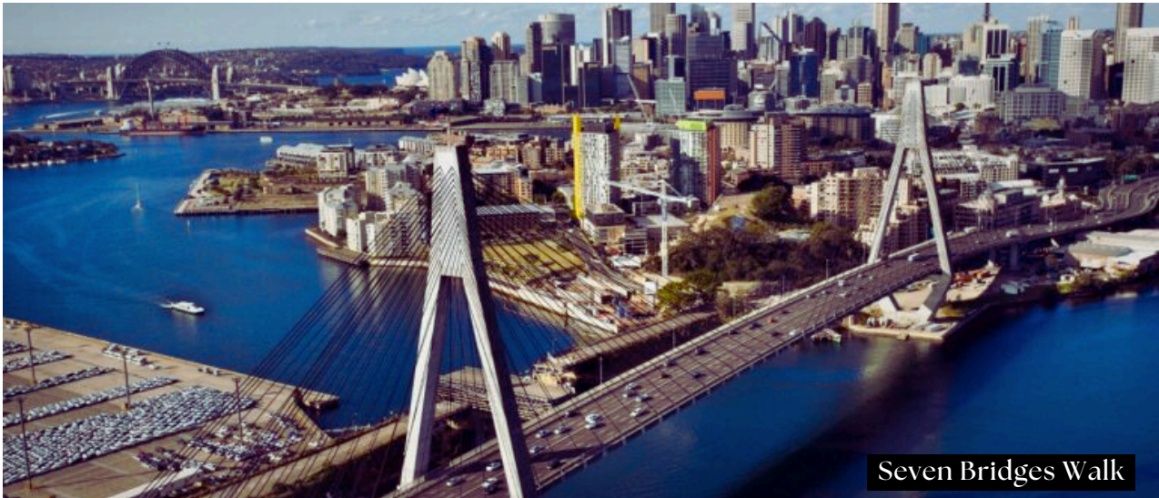
Seven Bridges Walk

The Bulgarian Cultural and Social Association